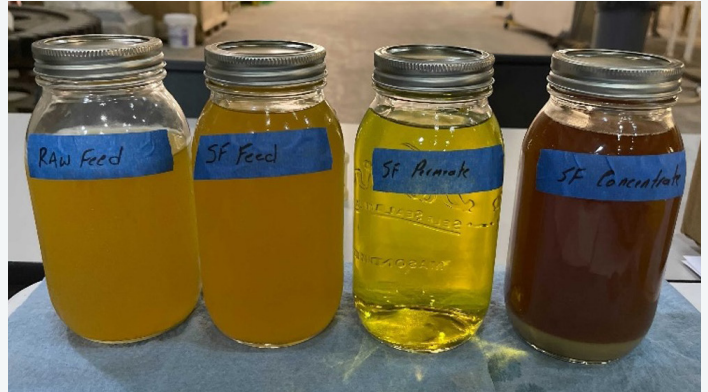
(Left to right) Raw Feed, ZwitterCo SF Feed, ZwitterCo SF Permeate, ZwitterCo SF Concentrate

See the difference in this bioprocessing example: